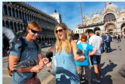
At St. Mark's Square, Italy by Biswatosh Sengupta