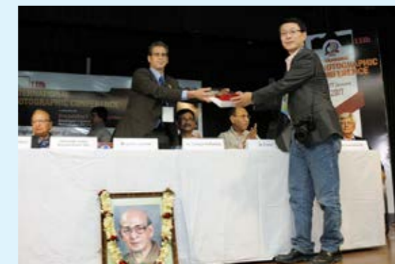
FIAP Secretary General presenting memento of the 11th International Photographic Conference to a Chinese Delegate