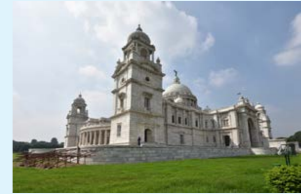
Victoria Memorial Hall Kolkata