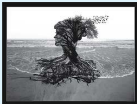
Rooted by Gautam Sen, India