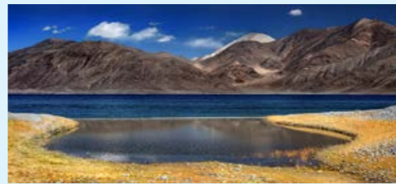
Landscape 9 by Saurabh Bhattacharyya, India