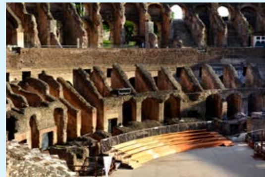
Colosseum, Italy by Biswatosh Sengupta