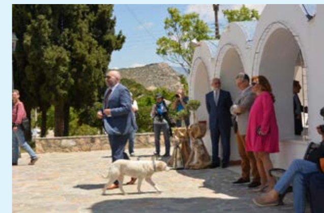
Waiting for the Bride by Biswatosh Sengupta