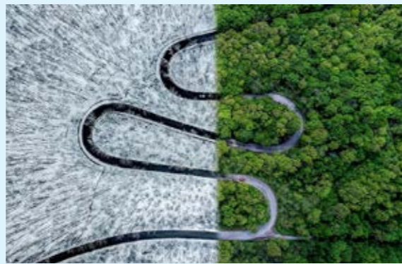
Weather Snake by Ovi D Pop, Romania

Photography can be a very powerful tool for creative expression. Creative photography principally finds its connoisseurs through salons, both national and international. International salons promote and propagate photography throughout the world and foster international fraternity. Salon is a French word which has long been used to refer to exhibitions by painters. Now we also use the word salons for a photographic exhibition. It is a wonderful platform for international understanding, providing opportunity to view works of various pictorialists under one roof. Salons help one understand and appreciate the various photographic developments going on throughout the world. Every year around 500 salons recognised by FIAP, and or PSA, are organised which cater for more than 9000 photographers from over 100 countries, who exhibit thousands of works.