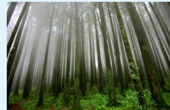
A forest in the Eastern Himalayas by Dr.Sayan Bhattacharyya, India