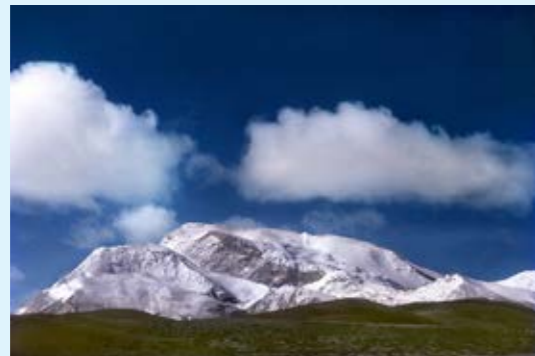
Gurla Mandhata Peak by Rathindranath Chakraborty, India

Travel Photography promotes tourism, makes people understand different lifestyles and human activities. It provides an opportunity to enjoy the beauty of wonderful nature subjects, which are an integral part of our lives. Through photography it is possible to enjoy the pristine beauty of the splashing water of the roaring sea at the Vivekananda rock temple, the grandeur of the Himalayas with its colourful hue, the fantastic natural scene at Kailash Manas Sarobar, the charms of the mountain desert at Ladakh, the awe-inspiring depths of the Grand Canyon and the magnificence of the Niagara falls etc. which have attracted and inspired humanity since eternity even without visiting the place. Human beings have always aspired to portray the astounding beauties of nature, through songs, poetry, painting and through photography.